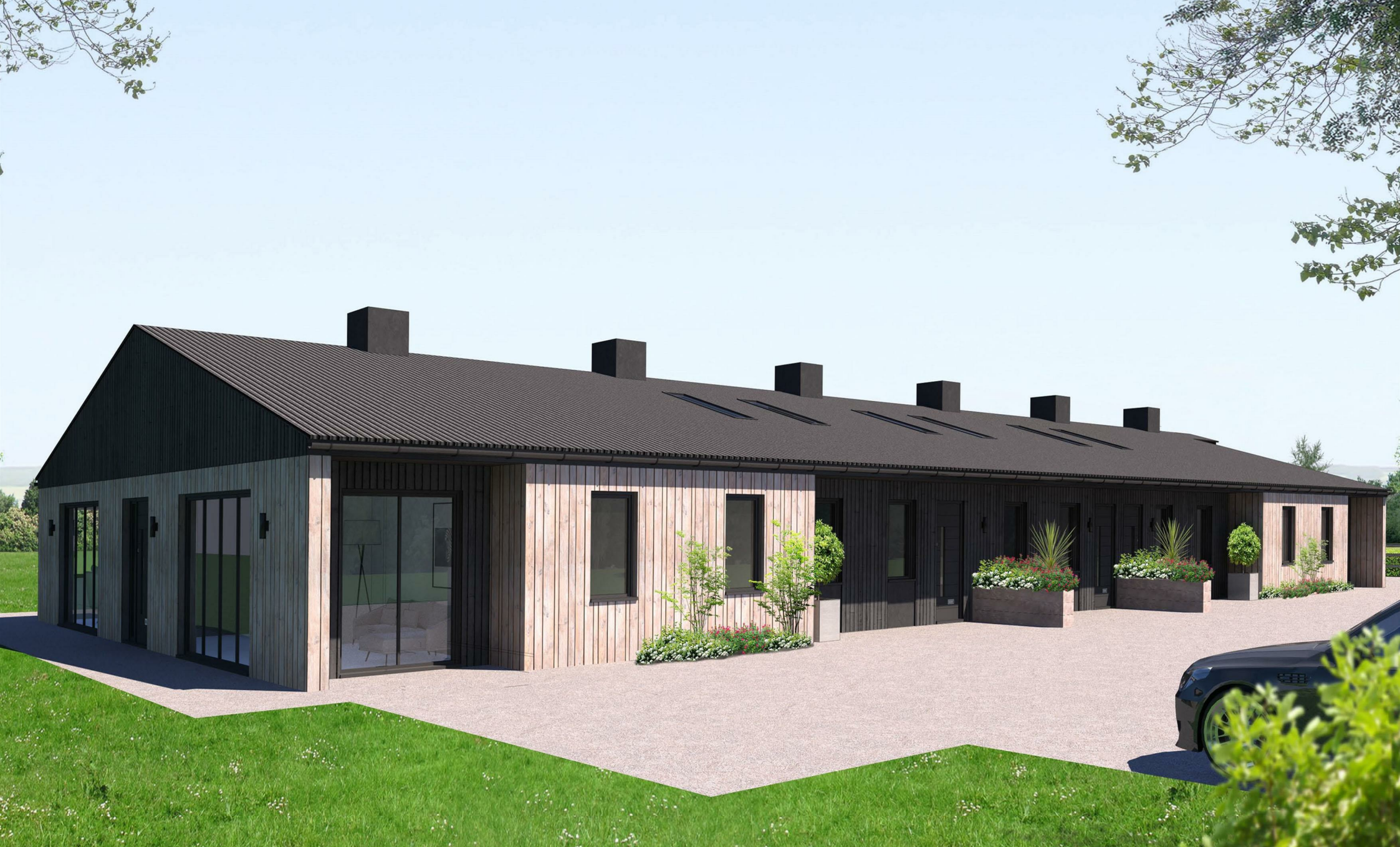
The Acre 1 The Closes, Sutton Farm, Claverley, Wolverhampton, Shropshire, WV5 7DD